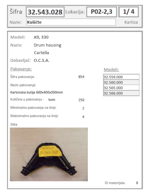
Figure 2. Kanban card