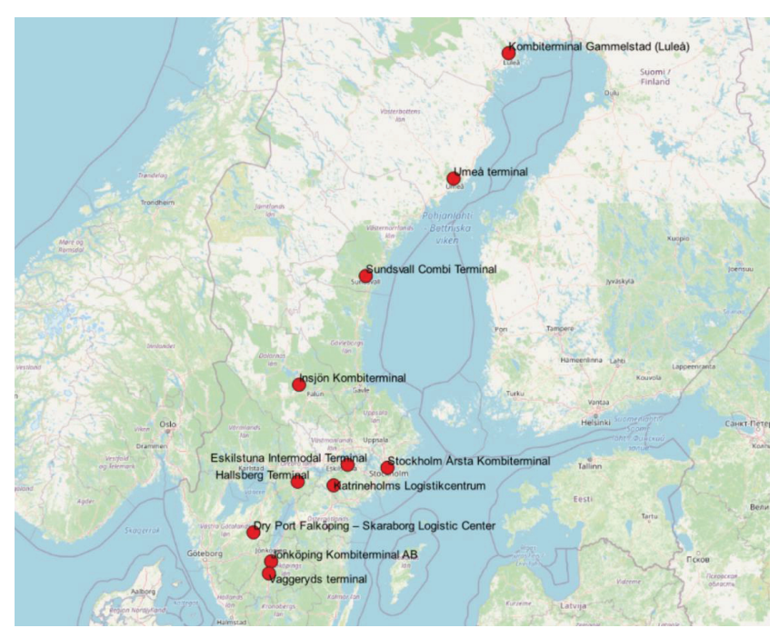
Figure 1. Dry ports in Sweden

Umeå terminal was initiated due to Bothnia Line – rail link connecting the north and the south of Sweden – which was introduced in 2010. The terminal is also connected to Stambanan that allows access to the entire railway network of Sweden. Most inbound goods are transported by train from terminals located in Göteborg, Malmö, Helsingborg and Nässjö. Umeå Combi terminal is established and owned by Trafikverket and then leased to Infrastruktur i Umeå AB (INAB). INAB in turn has hired Sandahls Goods & Parcel (a private company) to handle the daily operations. The main customers are Volvo, IKEA, Biltema and Carlsberg.