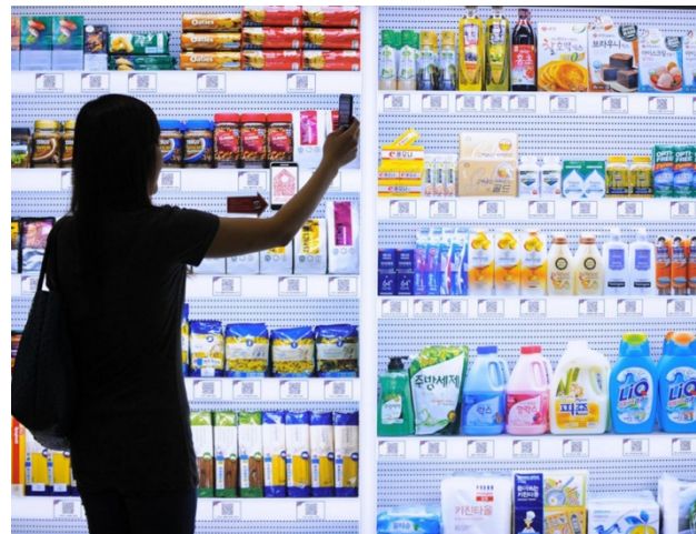
Figure 2. “Home plus” subway virtual store

The results of innovative approach were the following. Customers could buy the products whenever they wanted, and basically from any place without the need to go to the real store. Efficacy of purchasing was increased for the customers because they had more leisure time to spend with their families or on their favourite activities after working hours. Also the wasted time spent in the public transport was reduced because now it could be used for the shopping of daily goods. After the campaign, on-line sales were increased by 130% from November 2010 until the January 2011, and “Home plus” became number one retailer on the virtual e-market. Furthermore, the main goal was almost achieved because company is now very close second on the South Korean market and is heading towards the leading position. For this campaign company won the “Golden Lion”, significant award at the Cannes International Festival of Creativity.