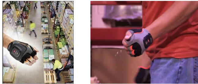
Figure 3.1.b – Overview of remote unit in the shape of order-picker's glove

The order-picker receives information related to the next picking location (OPF stop) based on the order-picking list. The option with this remote unit is in the form of glove (Figure 3.1.b, http://video.tdcolls.com/video/g_-V31UL4Ww ; named “Crown's QuickPick™”). By pressing the appropriate button, desired order of OPF is activated, with the possibility of sound signal as well.