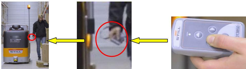
Figure 3.1.a – Overview of the remote unit bonded around order-picker's hand

The order-picker receives information related to the next picking location (OPF stop) based on the order-picking list. By pressing the appropriate button on the remote unit (Figure 3.1.a, www.still.de ; named "iGoRemote") desired order of the OPF is activated.