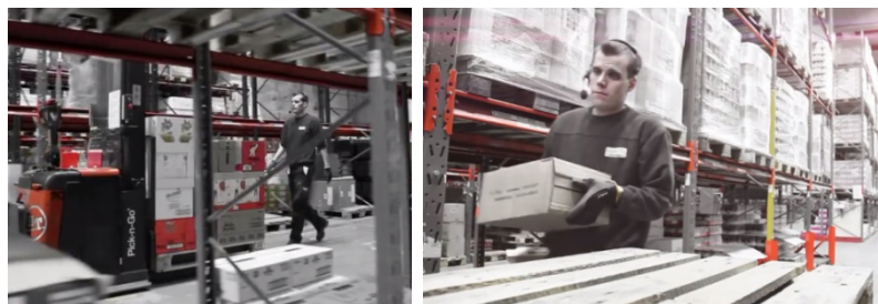
Figure 3.2 – Overview of OPF remote control using WMS

In this alternative, the applied WMS has double role: controls OPF and transfers instructions to the order-picker using pick-by-voice technology (Figure 3.2, http://video.tdcolls.com/video/g_-V31UL4Ww ; named “Pick-n-Go” by Toyota (BT)). Based on the WMS instructions, OPF moves to the location where the SKUs have to be picked and stops there. Order-picker receives information related to the picking location and the number of the ordered SKUs via headset, pick them and walk with items, putting them on the OPF. By voice – over microphone and communication system – WMS receives information related to the realization of the task for ordered SKUs. Based on it and according to the fulfillment of the order, WMS sends instruction to the OPF about the next picking location, order-picker's decides about the mode of movement (on OPF, or by foot behind it).