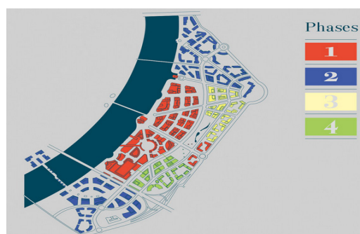
Figure 2. Phases of “Belgrade Waterfront” project realization

(Figure 1). The biggest part of the area, about 60%, is planned for the construction of residential units, 17% for commercial properties, 8% for hotels and a shopping mall, separately, 5% for shops and about 1% of planned areas for cultural and leisure activities. The buildings standing out are “Belgrade Tower”, 170 m tall, and the shopping centre which will cover more than 148,000 of square meters. When it comes to the street network, it was planned to keep the existing street matrix which will be linked by newly constructed boulevards. The project appreciates the cultural and historic heritage of the city of Belgrade, thus some buildings will not be razed during the works ( http://www.rapp.gov.rs ).