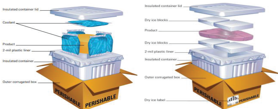
Figure 2. Packaging of goods a) gel b) dry ice (FedEx, 2019)

Monitoring and traceability – pharmaceutical companies, restaurants and retail food chains go in the direction of adopting visibility monitoring solutions in order to gain visibility and control in the entire supply chain. Data on delivery, location, data on records and traceability of the cold chain are easily accessible and very important because they provide immediate insight into the movement of goods, the condition of goods during transport and their location. The existence of software that determines exactly where the cargo is at all times and the ability to access this information via mobile phone or computer speaks of technological progress and is crucial for the next generation of services to be provided. Built-in sensors, including light, temperature and barometric conditions, monitor the condition of the product during its journey, triggering an alert if certain errors appear on your computer or mobile phone. GPS tracking allows stakeholders to know when products have left the warehouse and when they have arrived at their final destination. Therefore, logistics providers are increasingly investing in meeting visibility requirements. The number of points of contact is increasing, and knowledge of what is happening at each of these points of contact strengthens data for stakeholders to mitigate risk, improve logistical performance and standardize their metrics (Rodrigue and Notteboom, 2016).